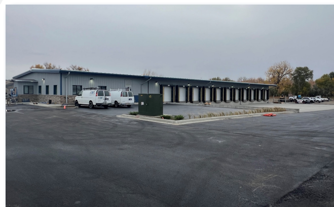
Ground has been broken in Billings! The new build has 23 doors, with an expected opening date of January 1, 2025.